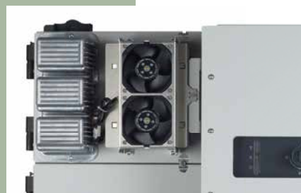
Replaceable power stage set